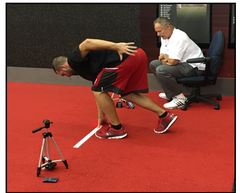
Dashr Timing system.