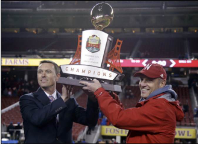
Nebraska defeats UCLA in Foster Farms Bowl

Nebraska Volleyball Wins a fourth NCAA Championship. The championship was held in Omaha, Nebraska in front of the largest crowd to ever view a volleyball game live at 17,561 in attendance.