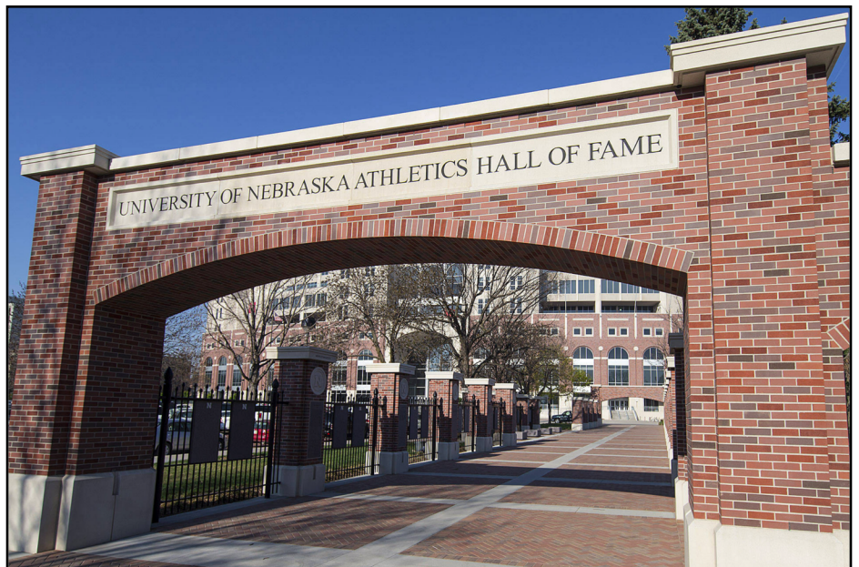
Nebraska Athletics Hall of Fame.

Nebraska creates the Nebraska Athletics Hall of Fame and the first class is inducted before the home opening BYU football game.