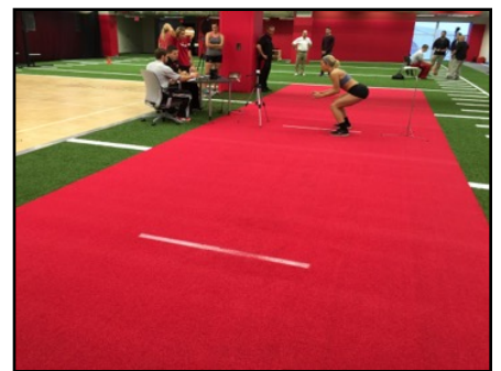
Pro Agility Run on new Red Turf