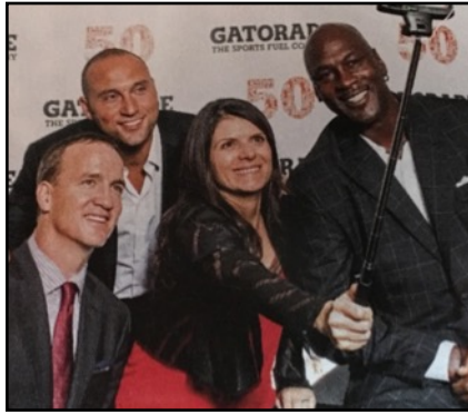
Peyton, Derek, Mia and Michael