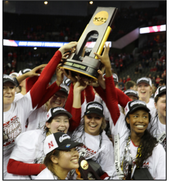
Nebraska wins 4 th National Championship with 3-0 win over Texas