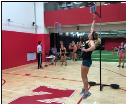
Vertical Jump on Force Plates