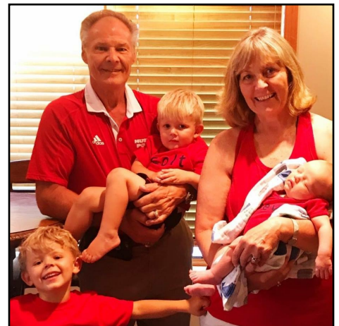
Cash then Colt and now Crew