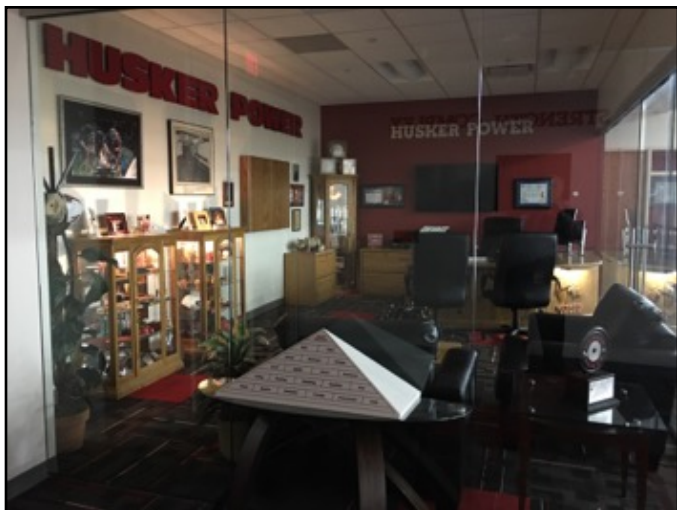
My new Headquarters