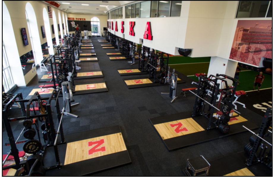
2015 Suh Strength Complex

The NCAA legislation went into effect requiring all Division I Strength and Conditioning Coaches to have accredited Certification. The NCAA recommended CSCS Certification from the National Strength and Conditioning Association or SCCC Certification from the CSCCa for all strength and conditioning coaches.